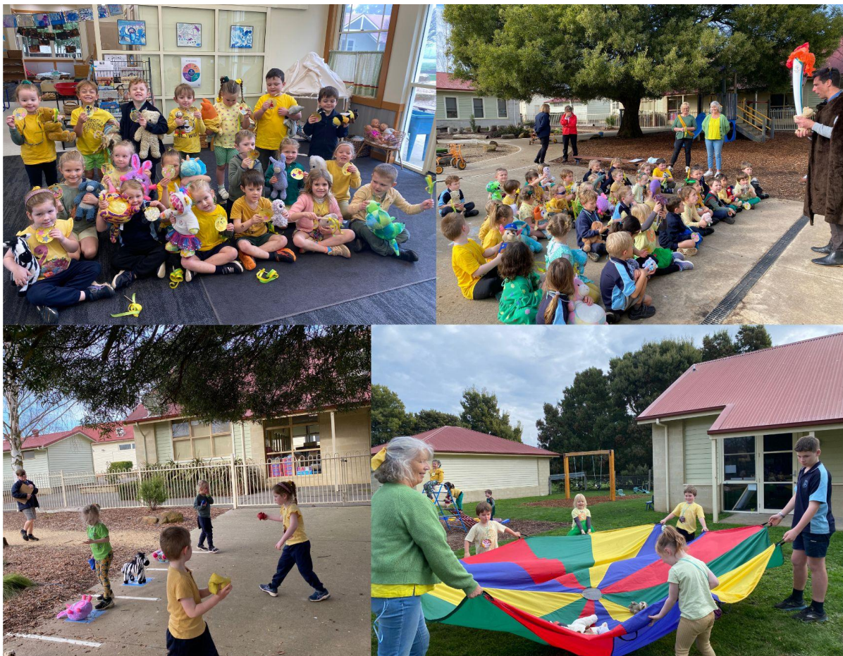
Kinder Teddy Olympics